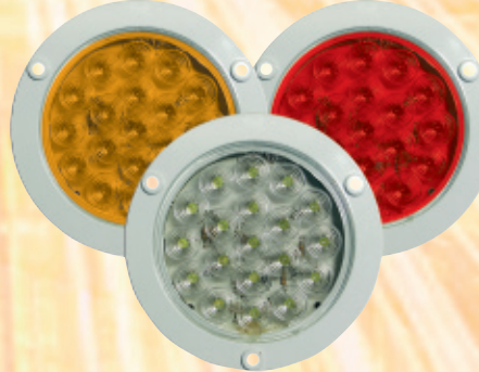
110 Series Lamps 12 volt 19 square LEDs Circle Pattern Lens 137mm Diameter