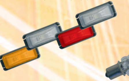
1156Y 12 or 24volt Indicator 13 LEDs