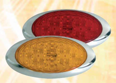
95 Series Lamps 12 volt 42 amber 34 red LEDs Clear Pattern Lens