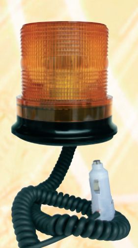
62 Strobe Beacon 12volt 60LEDs Magnetic Type 100mm x 125 Height