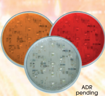
110 Series Lamps 10volt-30volt 45 LEDs Diamond Pattern Lens 108mm Diameter x 50mm